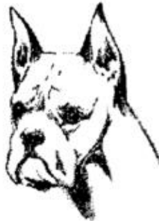
CROPPED - Doberman/Boxer