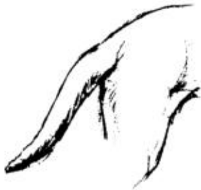
STRAIGHT - Pointer