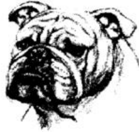
ROSE - English Bulldog