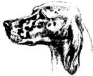
DROP - Hounds/Setters