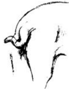
SCREW - Boston Terrier