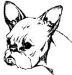
BAT - French Bulldog