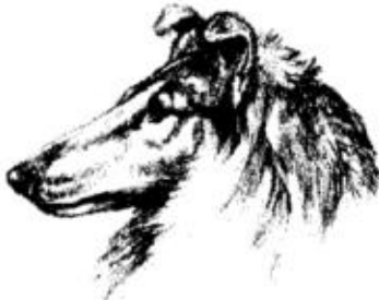
SEMI - PRICK - Collie