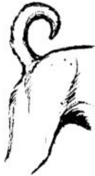
TIGHTLY CURLED - Basenji