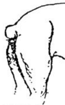
DOCKED - Boxer