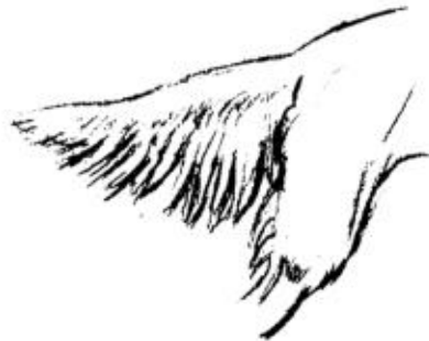
PLUMED - Irish Setter