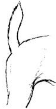
GAY - Beagle