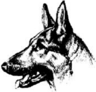
PRICK - German Shepherd