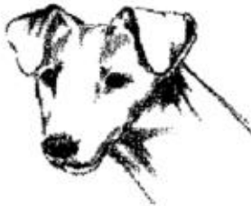
BUTTON - Fox Terrier