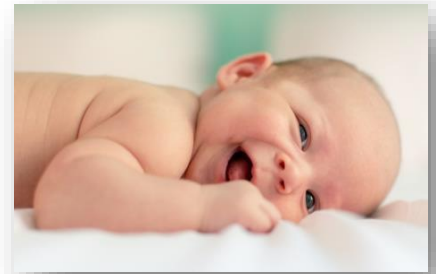
Spina bifida and encephalocele are neural tube defects usually apparent at birth.