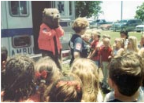
EMS personnel and Bearamedic Ready Teddy teach local children about staying safe during Texas EMS Week 2001.

service campaigns stress the importance of smoke detectors, and police departments conduct public education on impaired driving dangers and personal safety. Likewise, EMS/Trauma Systems, including the 22 RACs, must work together to educate the public on prevention issues and on proper access and use of the health system. EMS/Trauma Systems have been strong advocates for injury prevention education and continue to educate the public about issues such as bicycle safety and seatbelt use.