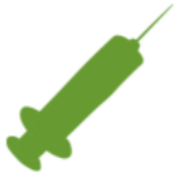
Vaccine Information Exchange