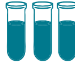
Lab Ordering and Results System