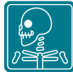
Trauma Image Sharing