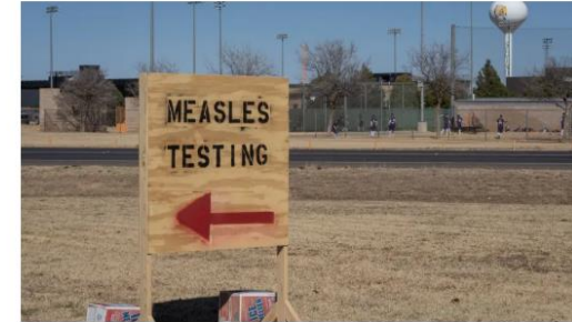
SEMINOLE, TEXAS - FEBRUARY 27: Signs point the way to measles testing in the parking lot of the Seminole Hospital District across from Wigwam Stadium on February 27, 2025 in Seminole, Texas. Eighty cases of measles have been reported in Gaines county