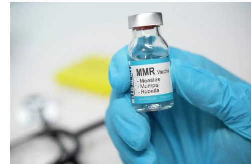
Texas measles outbreak: Infection case update for Friday Feb. 28.