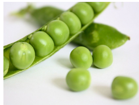
For specimen size comparison, a single garden pea is approximately 200 \mu L in volume.