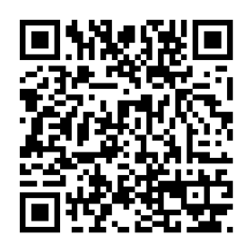
2024 Texas Notifiable Conditions List

*May also be submitted to DSHS as an Electronic Lab Report.