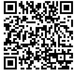
Texas Notifiable Conditions List

The Texas Notifiable Conditions List identifies the conditions that must be reported to the DSHS and their reporting time frames. The list is available online here . Or scan the QR code at right.