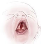
Baby with cleft palate

Women who smoke cigarettes during early pregnancy have a high risk of delivering a baby with cleft lip or palate. This condition results from the failure of the lips to form properly during pregnancy. The result is the upper lip or palate can have a large opening. (See illustrations). These defects can affect the infant's speech development and eating after they are born.