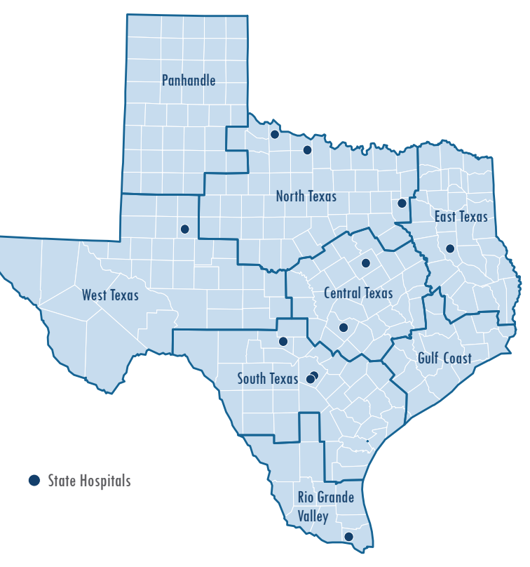
Figure 1. State hospitals in Texas

budgeted direct patient care RN FTEs on staff and six hospitals reported no change.