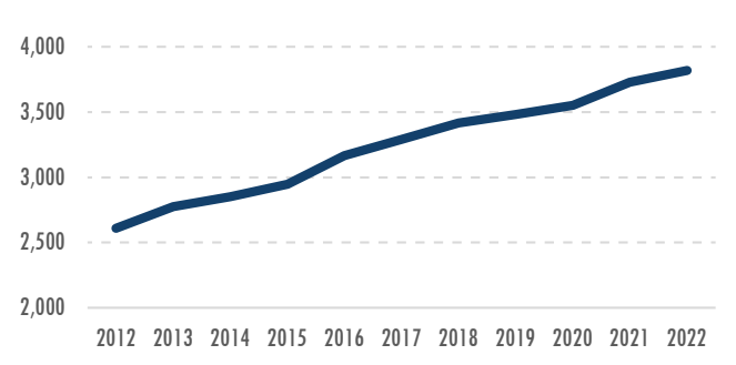
Figure 1. Total Athletic Trainers in Texas