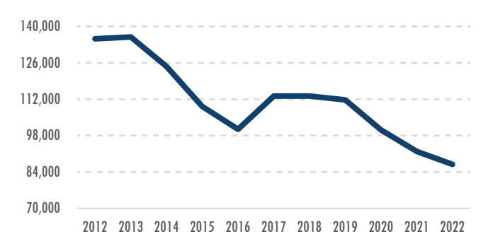
Figure 2. Ratio of Texas Population to CNA<sup>1</sup>