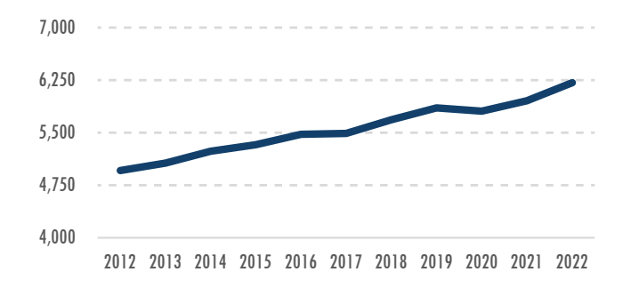
Figure 1. Total Chiropractors in Texas