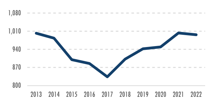
Figure 1. Total DTPs in Texas