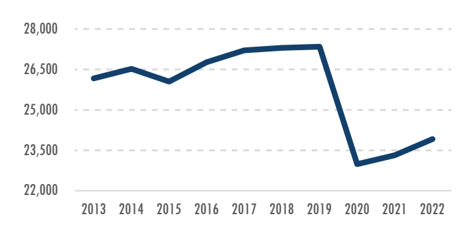
Figure 1. Total Massage Therapists in Texas