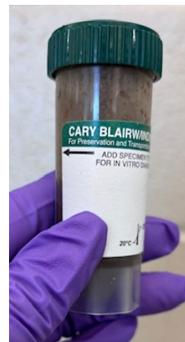
Example of a Cary-Blair stool specimen collection kit.