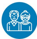
Grandparents and other family