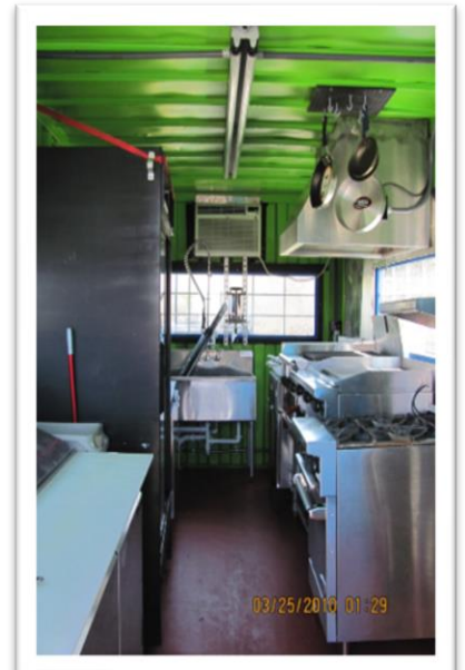
Smooth and cleanable surfaces