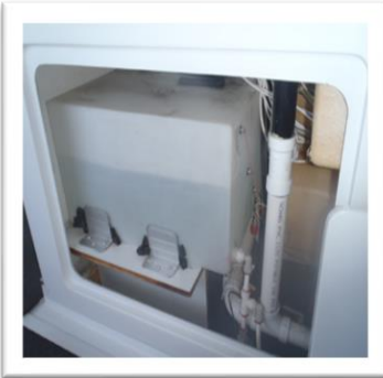
Potable Water Tank