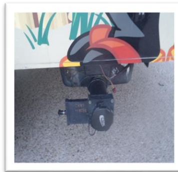
Liquid Waste Connection