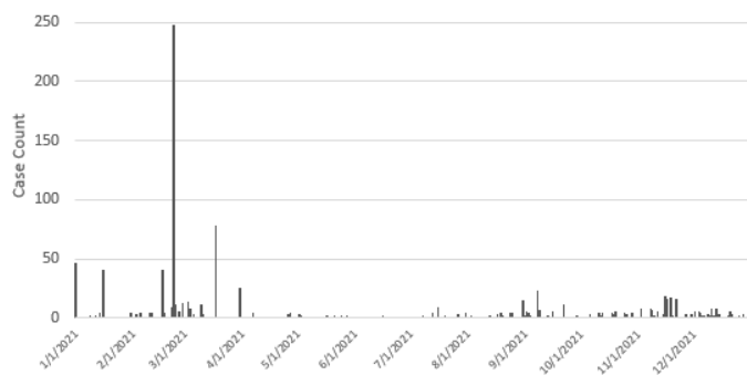
Daily COVID-19 Case Count