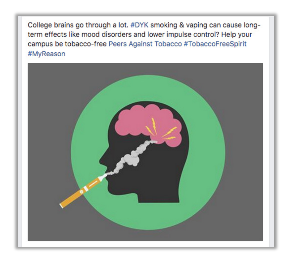
Figure 5: Peers Against Tobacco (PAT) Social Media