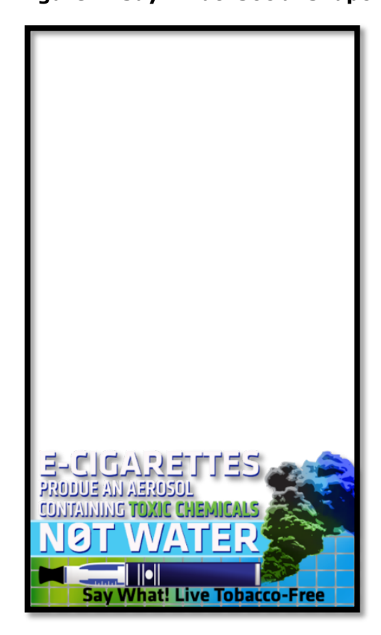
Figure 4: Say What! Social Snapchat Filter