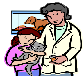
Cats and dogs alike should be neutered and vaccinated, preferably before they leave your facility. If the new owner is allowed to take care of the vaccinations and neutering after the adoption, be sure to have adequate means of follow-up to ensure that they follow through.

Please consider some special activities during June to promote adoption of shelter cats of all ages.