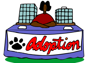
Local businesses may work with you to help adopt animals from your shelter.

I urge each and every one of you to try to get a program like this going in your community. It's a great way to save some lives and get to know the needs and concerns of your community!